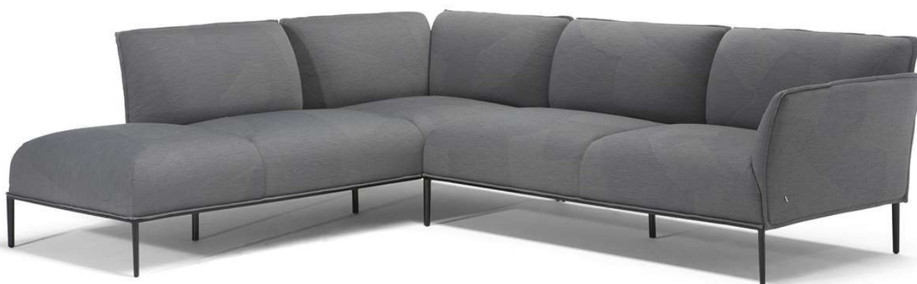
■ Vers. 200+019