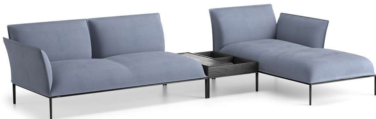
■ Vers. 018+827+049