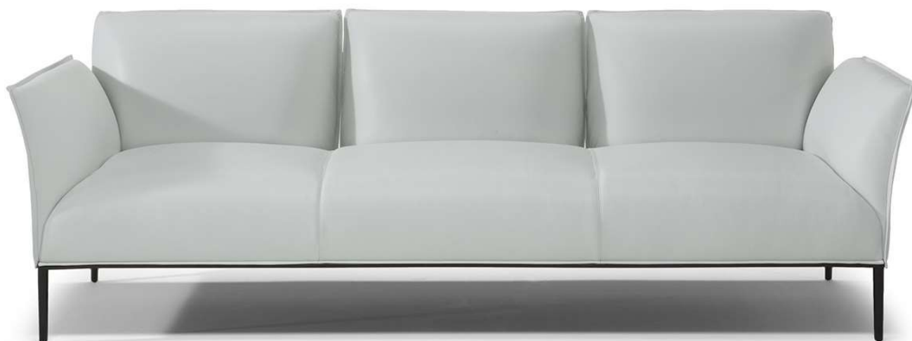
■ Vers. 064