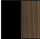
GLOSSY BLACK CHROME - EUCALIPTO WOOD