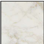
GLOSSY CALACATTA GOLD