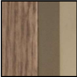
Glossy Champagne/Ash Wood Tobacco

47cm x 47cm H 51cm 18,5" x 18,5" H 20,08" 47cm x 47cm H 52cm 18,5" x 18,5" H 20,47"